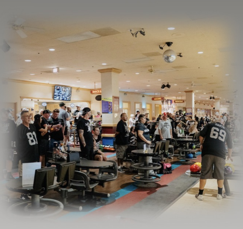
Fans gather at Gold Coast Casino for the first ever Raider Dad bowling fundraiser to pass their fandom onto the next generation.

"You see how the generation is being raised—they are being raised to be apart of us and our family. They are going to carry on, it's a beautiful thing. Generation after generation." —Lincoln Kennedy